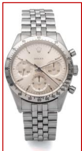
LOT 293 ROLEX, REF. 6239, DAYTONA ALBINO BIG RED DIAL

Another extremely rare and attractive Rolex Daytona will go under the Antiquorum hammer: LOT 293 Ref. 6239 Daytona Albino Big Red Dial with a rare and attractive dial. Most probably a “test” dial, Antiquorum experts assume this piece is a prototype since this monochromatic dial never officially appeared on the market.