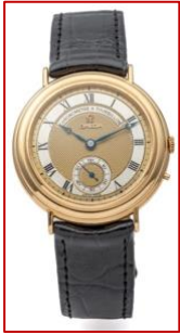
LOT 444 OMEGA, CHRONOMETRE A TOURBILLON, YELLOW GOLD

Estimate: CHF 100,000 - 200,000 HKD 800,000 - 1,600,000 USD 100,000 - 200,000