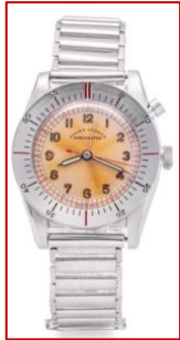
LOT 292 ROLEX, REF. 3346, ZEROGRAPHE, STEEL

Even more rare than the reference 4113, which is considered the holy grail for collectors, Rolex Ref. 3346 Zerographe LOT 292 is the first ever Rolex Chronograph to feature an in-house movement: a 17-jewel, manual-wind Rolex caliber with a flyback stop-seconds function. The Zerograph, a model whose demand is growing, will go under the hammer with a very interesting estimate.