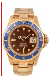
LOT 224 ROLEX, REF. 1680, SUBMARINER, “ARABIC” TROPICAL DIAL FULL SET, YELLOW GOLD, MADE FOR THE UAE ARMED FORCES

Estimate: CHF 30,000 - 50,000 HKD 240,000 - 400,000 USD 30,000 - 50,000