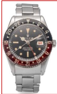
LOT 400 ROLEX, REF. 6542, GMT MASTER GILT DIAL, BAKELITE BEZEL

Lovers of the Rolex Daytona “Paul Newman” dials will be thrilled to discover LOT 234 Rolex Ref. 6264, a gorgeous example of this reference in near mint condition & LOT 406 Rolex 6265 Daytona Oyster Panda MK2. This reference has become the most expensive vintage wristwatch ever sold at auction. A key moment of this Sunday’s auction will undoubtedly be with this lot in very fine condition, which for the first time is appearing on the market after being entrusted by the family of the original owner.