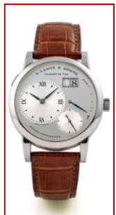
LOT 434 LANGE & SOHNE, REF. 101.026, LANGE 1 STEEL, FULL SET

A rarity in steel , A. Lange & Söhne Ref. 101.026 Lange 1 LOT 434 represents the most desirable and rare watch made from the exceptional German Manufacture. According to Antiquorum experts' research, we can consider that there are less than 30 pieces in steel . Only few examples surfaced on the market with huge results and great interest from all over the world. The present watch, sold in Milan in 1997, comes from the family of the first owner and has never been on the market or at auction.