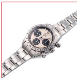
LOT 406 ROLEX, REF. 6265, DAYTONA, «SO CALLED» PAUL NEWMAN OYSTER PANDA MK2, STEEL

Estimate: CHF 100,000 - 200,000 HKD 800,000 - 1,600,000 USD 100,000 - 200,000