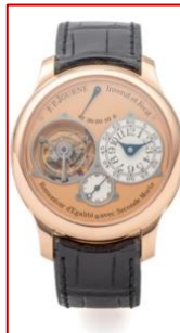
LOT 427 FP JOURNE, TOURBILLON REMONTOIR D'EGALITE, SECONDE MORTE, PINK GOLD DIAL, PINK GOLD

The relatively young brand F.P. Journe keeps building its success and its prestige within circles of watch collectors